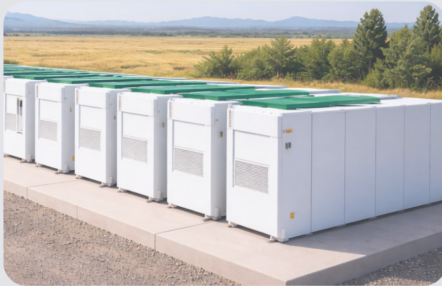
Grid-Scale Battery Energy Storage System

A major 500 MW / 1,000 MWh grid-forming Battery Energy Storage System (BESS) in Australia is helping transform a former fossil-fuel site into a modern renewable energy hub. The system provides essential grid-forming capability, renewable firming, and frequency services to support the stability of the National Electricity Market as thermal generation retires.